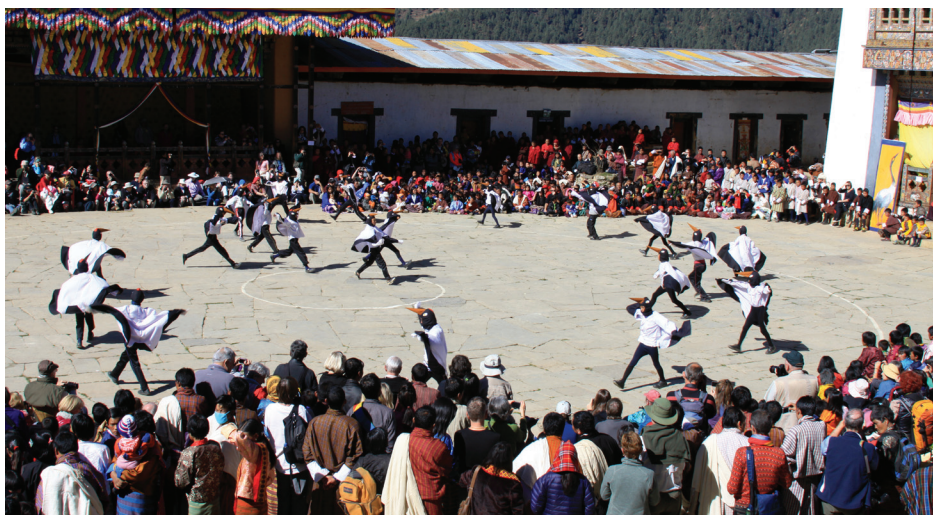
14th Black-necked crane festival in Phobjikha

As the community of Phobjikha valley sheltered themselves in the confines of their warm houses escaping the cold morning and windy afternoon, the majestic Black-necked Cranes punctuated the frost laden wetlands of Phobjikha valley looking for cozy place to feed and play around. The arrival and departure of the cranes is very much the part and parcel of the lives of the locals.