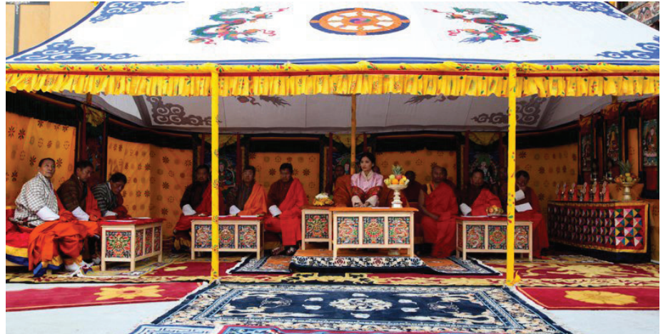
Her Majesty Gyaltsuen during RSPN's Silver Jubilee Celebration

The Royal Society for Protection of Nature (RSPN) celebrated its 25 years of service to the environmental conservation on 24 October, 2012 in its new headquarters, Kawajangsa, Thimphu.