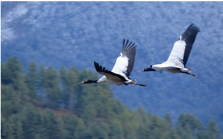
Black-necked cranes in Phobjikha (File picture)

A group of three cranes including one juvenile arrived on 27 October 2012 at around 12:30 pm (BST) in their winter home, Phobjikha. According to 2011-