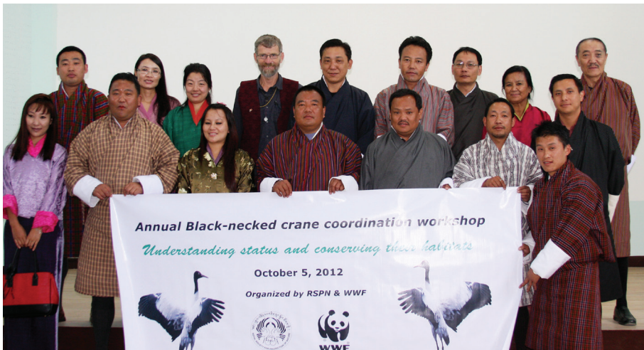
The participants comprised representatives from various relevant agencies

The Second Annual Black-necked Crane (BNC) Stakeholder's Coordination Workshop was held in Thim-