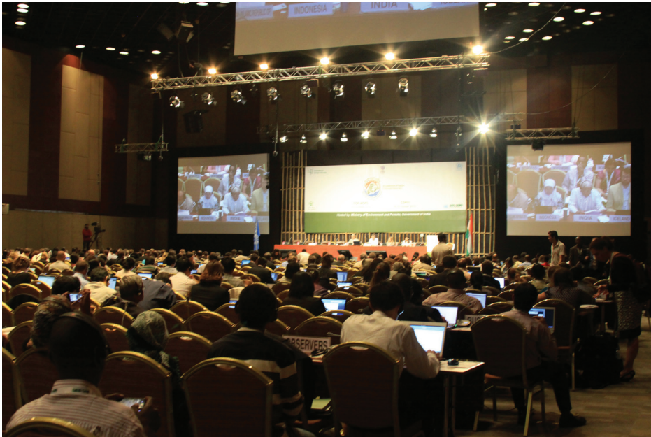
The biodiversity talk in session in Hyderabad, India