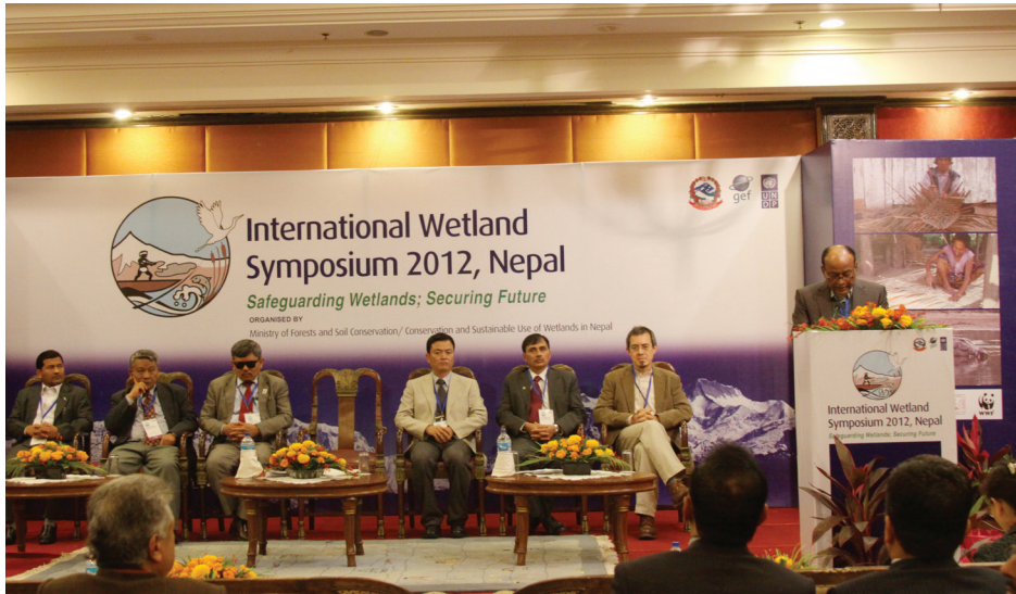
Opening of International Wetland symposium in Nepal.

An International Wetland Symposium (IWS): Safeguarding Wetlands; Securing Future was held in the beautiful city of Pokhara, Nepal, between 7- 10 November 2012. It was organized by the