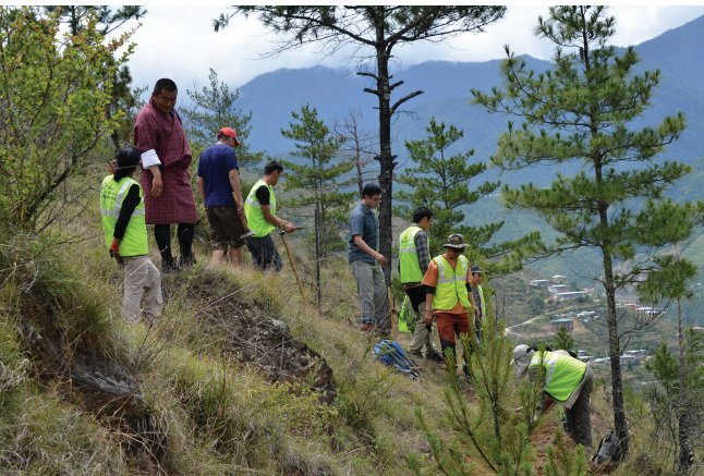
The program was led by His Excellency Agriculture Minister