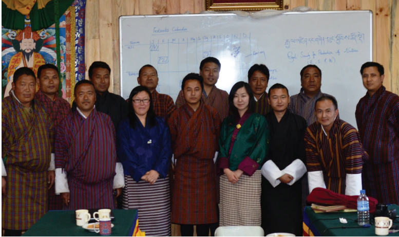
RSPN Officials and the group members