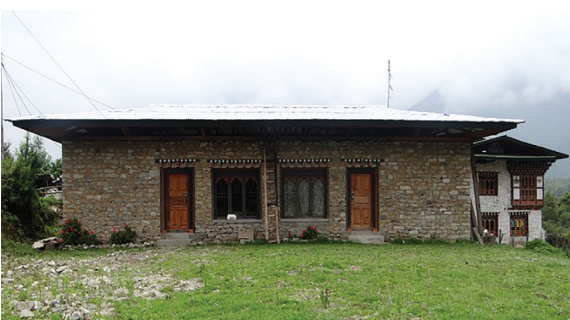
RSPN’s field office at Buli, Nangkor Gewog

With the introduction of “Conservation and Sustainable Management of Wetland in Buli” the field office of RSPN in Zhemgang is now re-located to Buli, Nangkor Gewog which is at a