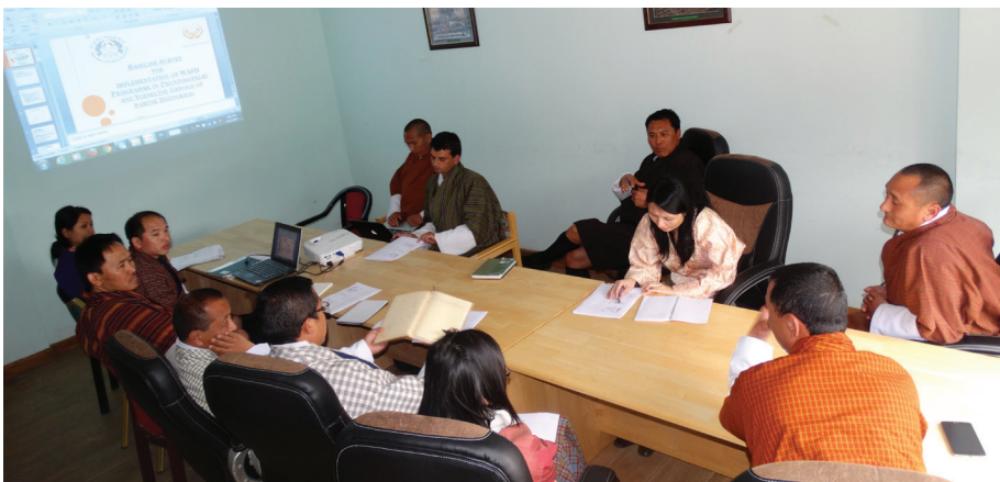
Discussion during the presentation among stakeholders

A half-day presentation of Baseline Survey Report on “Strengthening Water, Sanitation and Hygiene (WASH) components of two Gewogs of Phuntshapelri and Yoeseltse in Samtse District was organized by RSPN on 13th April, 2015 in RSPN’s Board Room, Thim-