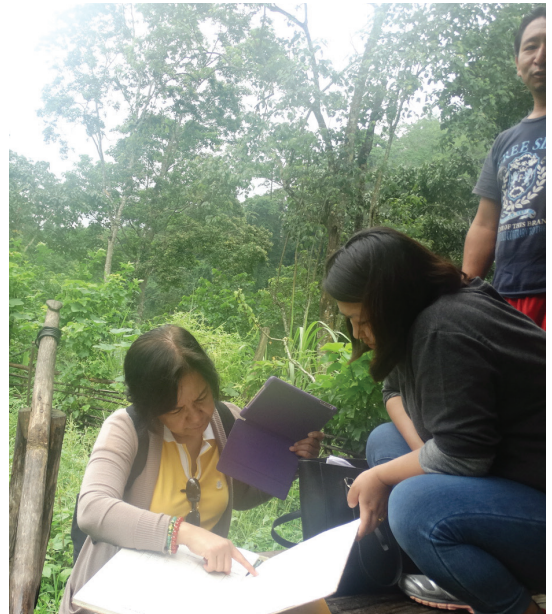
The officials review the activities

The project on Gender-inclusive Access to Clean and Renewable Energy in Bhutan was approved by Asian Development Bank (ADB) on 18th March 2011 with a total amount of USD $3 million through JFPR (Japan Fund for Poverty Reduction) grant to increase women's role and visibility in policy across South Asia and at the ground level through direct energy sector interventions in Nepal, Sri Lanka and Bhutan. Pursuant to the grant assistant report, ADB has conducted the semi-annual project review mission to determine the efficiency and effectiveness of the use of the project grant.