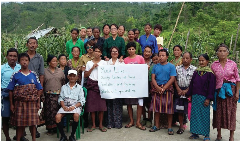
Workshop participants from the local community.

R SPN, with financial support from SAARC Development Fund (SDF) and technical assistance from PHED under Ministry of Health and SNV, has implemented awareness program on Rural Sanitation and Hygiene Program (RSAHP) as part of “Strengthening water,