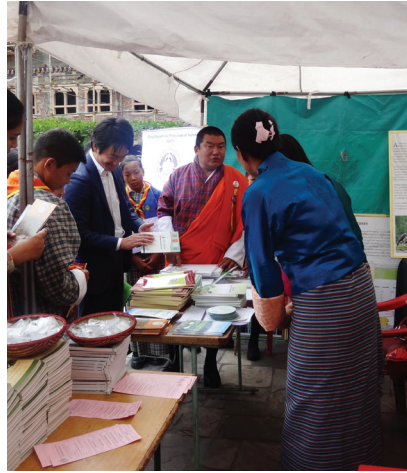
The Chief Guest visited exhibition stall put up by RSPN to commemorate the day.

Coinciding with World Environment Day on June 5, 2015, Royal Society for Protection of Nature participated in an exhibition on solid waste management at the Clock Tower in Thimphu.