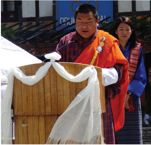
His Excellency the Agriculture Minister delivers his address on the day

“Seven Billion Dreams. One Planet. Consume with Care.”