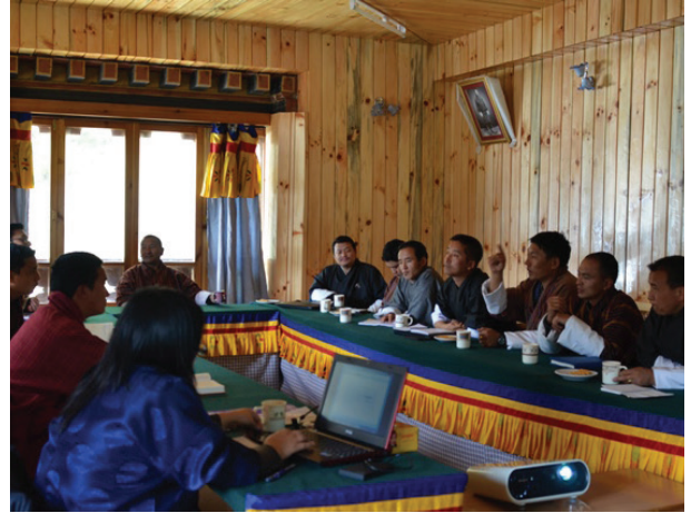
Introductory meeting with the group members

A Community-based Sustainable Tourism (CBST) Project Working Group in Haa Dzongkhag was formed on 14th April 2015. The working group comprises of representatives from