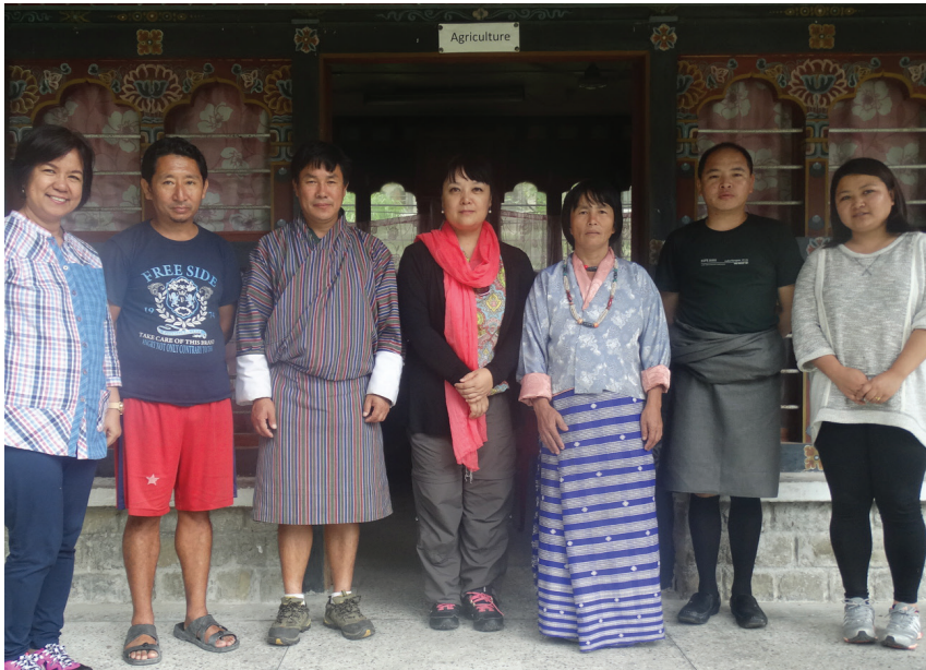
Review mission team with the local community representatives