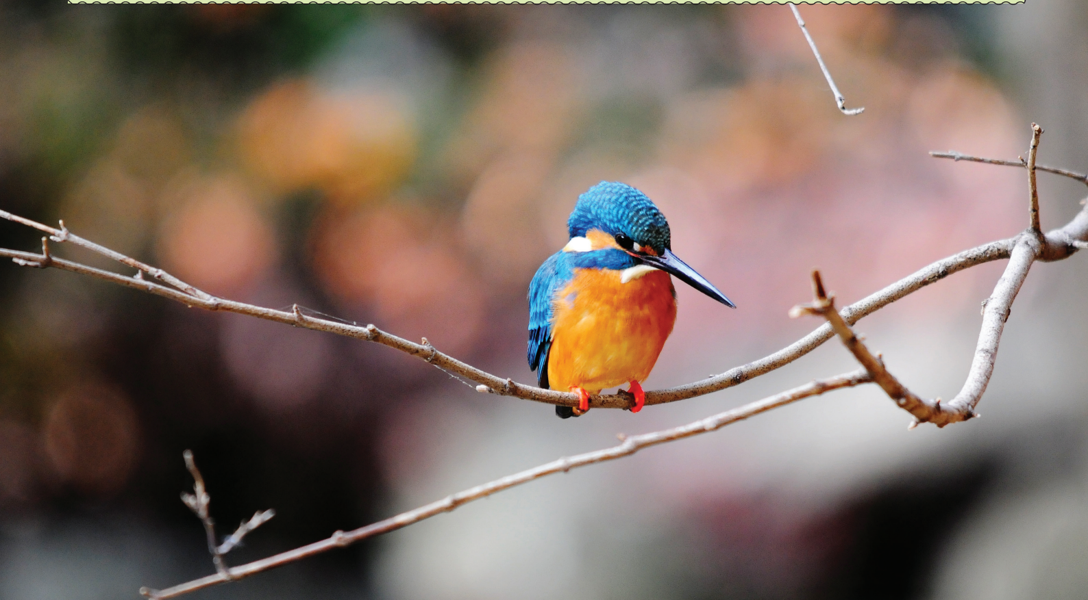
Common name: Common Kingfisher Scientific name: Alcedo atthis

- ( http://www.unep.org/champions/laureates/2005/DrukGyalpo.asp )