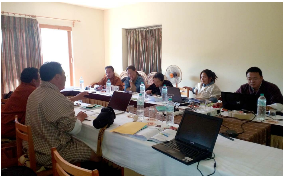
The reviewing committee

The review workshop on Class X Environmental Science(ES) textbook was held at the Khangkhu Resort in Paro from September 29 to October 2, 2016. The objective of the workshop was to review and finalize class ten Environmental Science textbook through discussions with the reviewing committee comprising of Environmental Science teachers and other stakeholders, and to build and implement effective teaching and learning of ES. The reviewing committee comprised of four ES teachers from four different schools, two Curriculum Development Officers from Royal Education Council, a representative from Bhutan Trust Fund for Environment Conservation (BTEFC) and RSPN. During the workshop, the shortcomings in the textbook were highlighted and changes were incorporated accordingly. The final text book will be distributed to schools by the first week of December 2016. The participants voiced their concerns about not having continuation of the ES subject for classes XI and XII. It was apprised that a proposal on the ES textbook for class XI and XII will be proposed to the BTEFC.