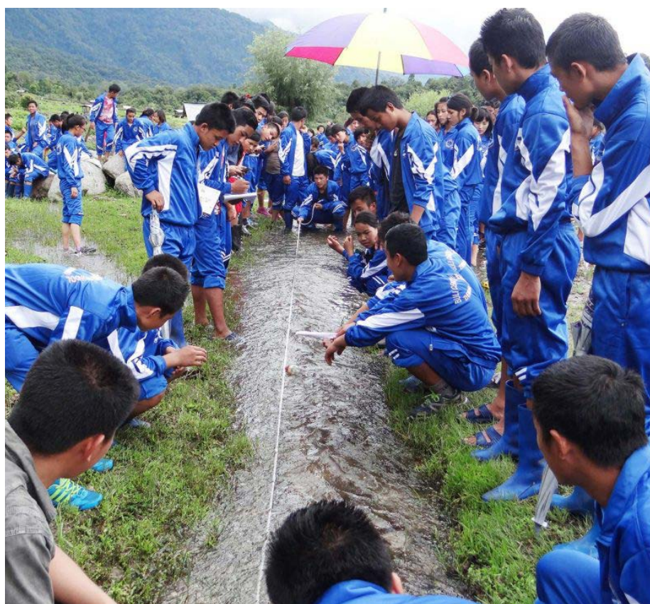
Students of Buli central School

Demographically, Buli is a small community with approximately 600 people living in a pristine environmental. The locals have a strong spiritual attachment with the nature. As a result, the Buli village is dotted with the beautiful natural and man-made wetlands which color the already exquisite landscape of Buli. The wetlands which are of national and international importance is absolutely in pristine state without much anthropogenic pressure. However, the constant upscale on development has been an inevitable factor causing loss of wetland to infrastructure development. Towards safeguarding the rich wetlands of Buli, the wetland conservation and sustainable management project was initiated in Buli under Zhemgang Dzongkhag. The project is funded by GEF/Small Grants Program, UNDP, and is implemented by RSPN.