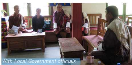
With Local Government officials