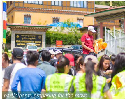
participants preparing for the move

found that the Chubachu stream is grossly contaminated. The second TtC test results measured a total of 158,316 coliform bacteria in 100 mL of water, an increase of 41,456 mL from the first test conducted in August last year (refer table). Thermotolerant coliform is a WHO recommended test for the drinking water quality test.