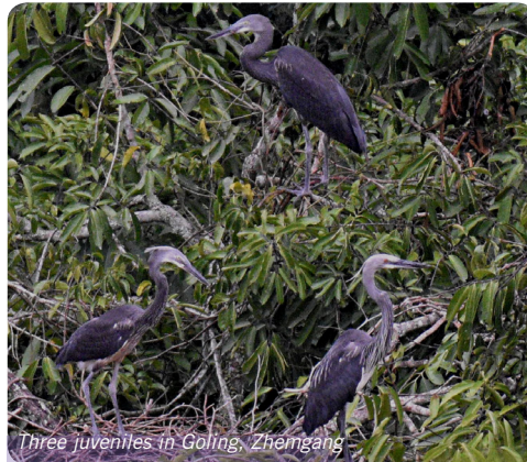
Three juveniles in Goling, Zhemgang

RSPN research team was in the field looking for WBH nests from June 12 to 27, 2018.