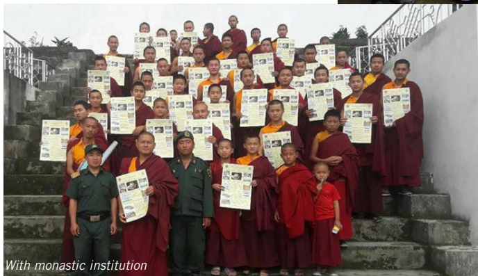
With monastic institution