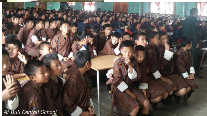
At Buli Central School