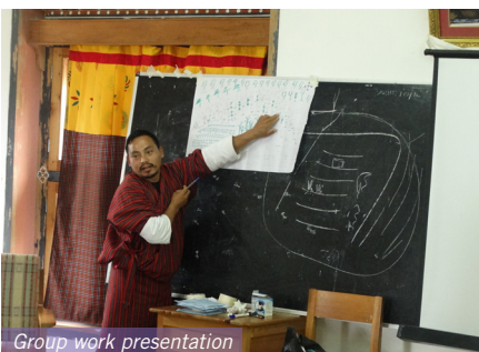
Group work presentation