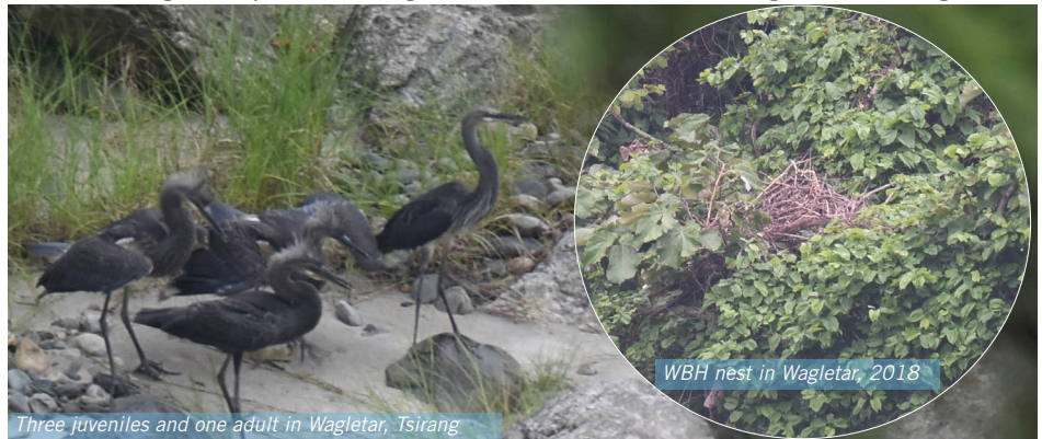
Three juveniles and one adult in Wagletar, Tsirang

However, the nest was found predated on June 30, 2018. Such findings of unsuccessful nests clearly portrays the survival issues faced by the critically endangered White-bellied Heron. During the trip the team sighted total of seven birds in Tingtibi and Goling area in