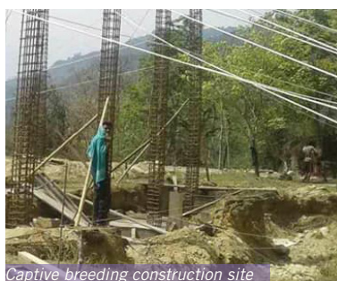
Captive breeding construction site

The RSPN team and a donor representative from BTFEC visited Changchey at Tsirang to monitor the construction of the White-bellied Heron Captive Breeding Centre. The Centre aims to increase the population of the critically endangered White-bellied Heron through captive rearing and research. The construction is expected to be completed in the next two years.