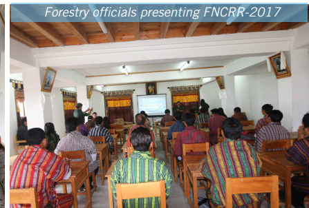
Forestry officials presenting FNCRR-2017