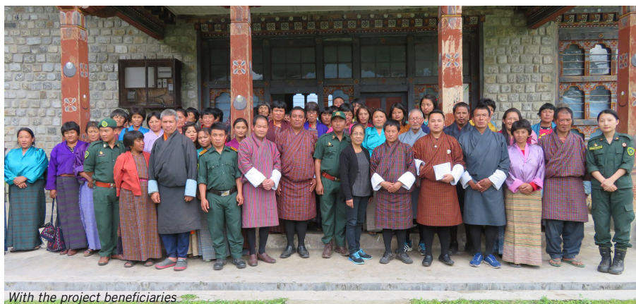
With the project beneficiaries

During the visit, monitoring team interacted with Dasho Dzongda, Local Government officials and project beneficiaries. Under this project, RSPN conducted series of training and workshops to different villages and stakeholders under Nangkhor Gewog.