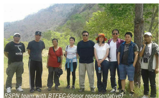
RSPN team with BTFEC (donor representative)