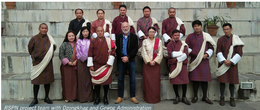
RSPN project team with Dzongkhag and Gewog Administration