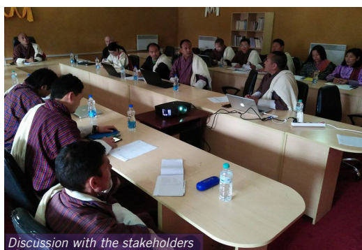
Discussion with the stakeholders

April 11 - 12, 2018. The team discussed at length on project budget and activities, and implementation approaches such as planning, reporting and transfer of project fund. The one and a half year project, funded by Civil Society in Development (CISU) based in Denmark, is implemented by RSPN with technical support from Organic Denmark in close collaboration with various stakeholders like National Organic Program based in ARDC-Yusipang of the Department of Agriculture, Dzongkhag and Gewog Administrations.