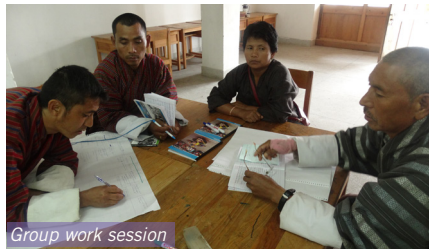
Group work session