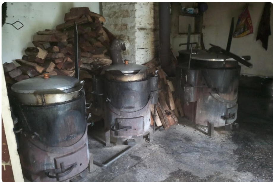
The old cooking stoves