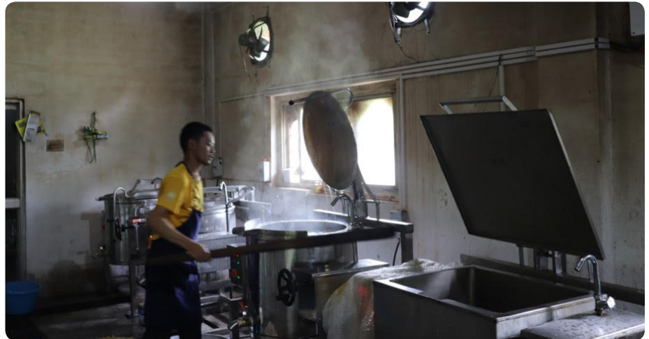
The new conventional fuel-efficient stoves

From Table 1, it can be inferred that there is almost similar operational cost between conventional and green kitchen. However, indirect benefits such as energy efficient cooking leading to reduction in GHG emissions and thus contributing to environmental conservation, enhancement of health and well-being of the college community, pavement of environment-education by taking individual responsibility to reduce carbon footprint which are beneficial in the long run are achieved. The result could be used to inform stakeholders especially institutional kitchens to opt for green kitchen over conventional kitchen.