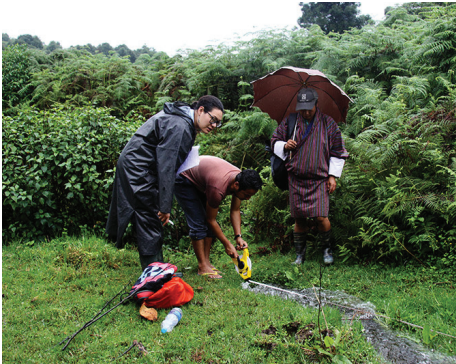
Assessment team measuring the length of a stream to measure velocity and volume by float method.