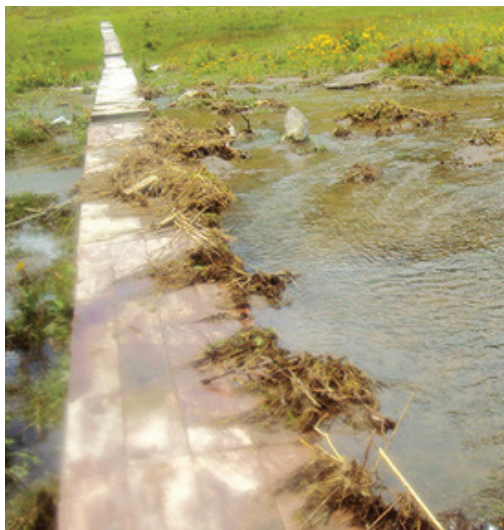
The flooded wetland board walk.

The river washed all the debris on its way to the wetlands and deposited it on the boardwalk. Although there were no complaints regarding the damaged boardwalk from any guests or guide, RSPN officials at the Black-necked Crane Visitor Center in Phobjikha (Gangtey and Phobji) were engaged in clearing the debris for one hour and making boardwalk safe for use.