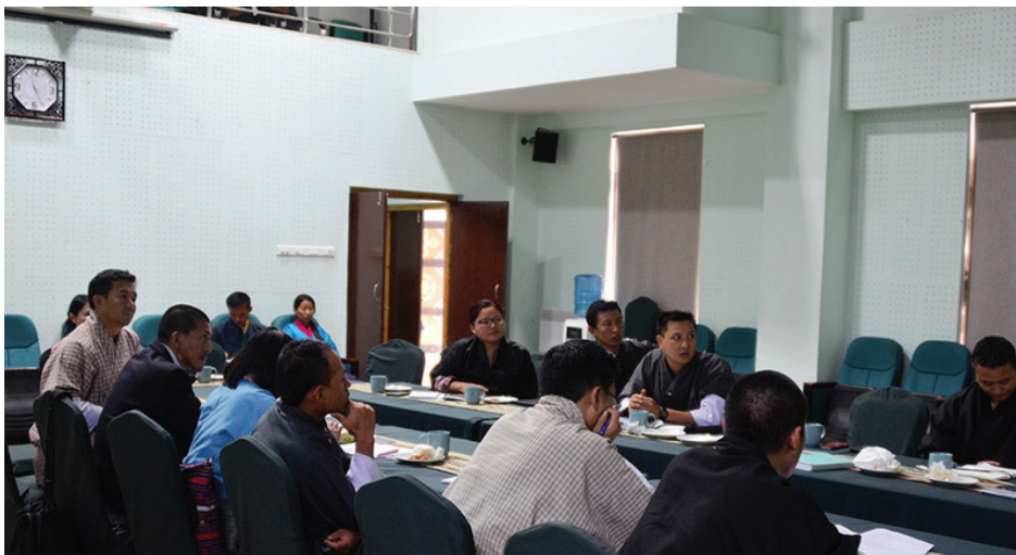
The meeting in session

The 2nd quarterly meeting of the steering committee for the community-based sustainable tourism (CBST) project in Haa was held on 29th July 2015 at the Jigme Khesar Environmental Resource Centre (JKERC) Auditorium, RSPN in Thimphu.