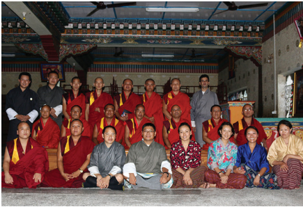
The participants of the workshop