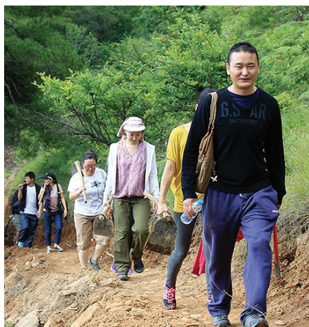
RSPN staff volunteered in eco-friendly biking trail development