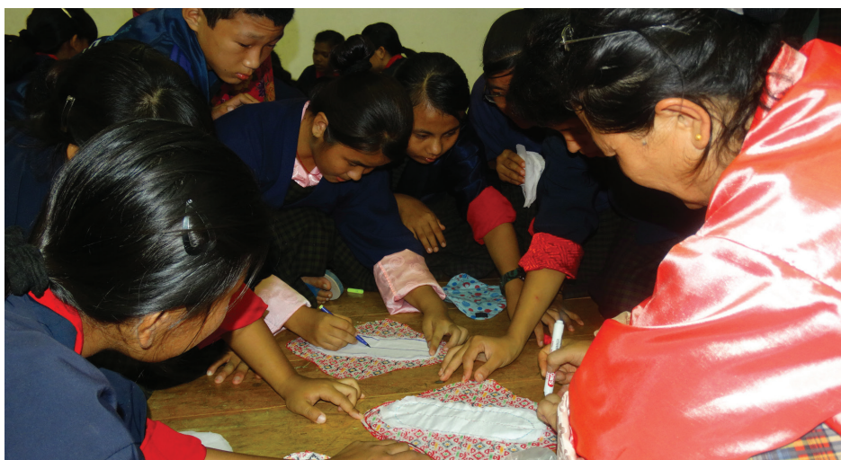
The resource person trains students to make custom sanitary pads.

The time has come to promote – loudly and unashamedly – the role of good Menstrual Hygiene Management (MHM) as a trigger for better and stronger development of girls and women on their personal, educational and professional.