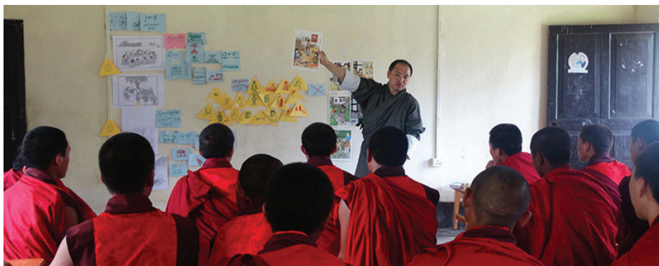
Workshop in session for one of the monastic institutions

The mission of Behavior Change Communication (BCC) workshop, as part of Rural Sanitation and Hygiene Programme (RSAHP), is to improve the health of the school and monastic institutions by reducing the incidence of water borne related diseases. It is also to bring about improved health quality of life through access to quality sanitary toilets, hygienic use of toilet and adequate facilities for hand washing with soap.