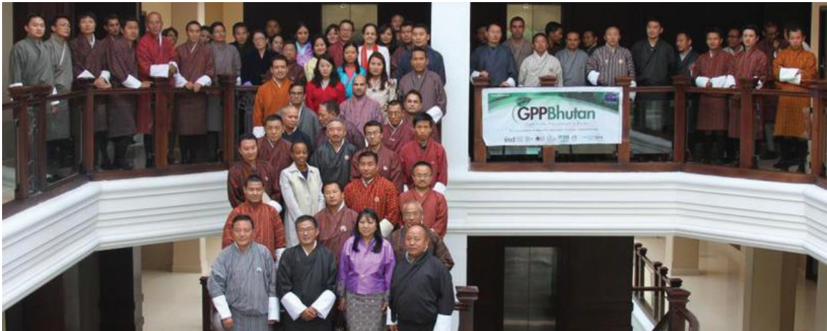
Participants of the GPPB seminar

On September 3, 2015 at the Ariya Hotel in Thimpu, delegates from the public and private sector came together to learn about and discuss the findings of a EU-funded, SWITCH Asia project on Green Public Procurement in Bhutan.