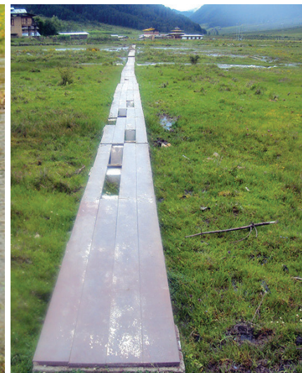
The staff later cleaned the board walk.