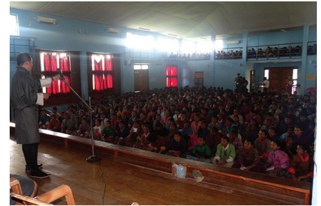
A session with students.

The objectives of the workshops were to: