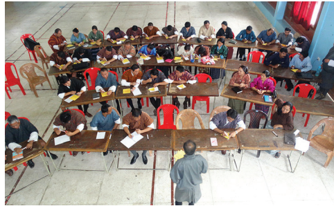
A session with teachers of various schools