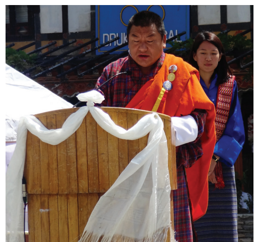
His Excellency the Agriculture Minister delivers his address on the day

"Seven Billion Dreams. One Planet. Consume with Care."