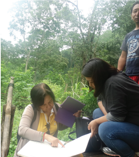
Review mission team with the local community representatives