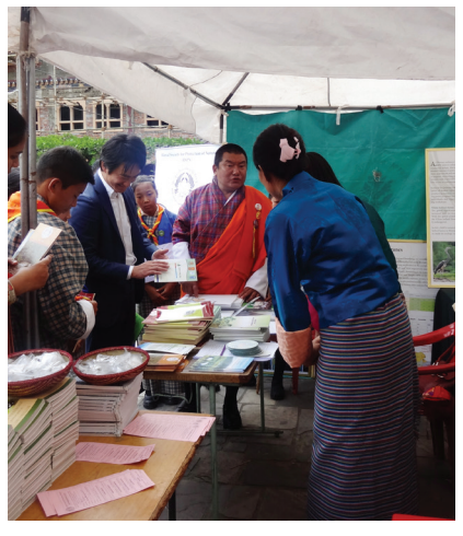
The Chief Guest visited exhibition stall put up by RSPN to commemorate the day.

Oinciding with World Environment Day on June 5, 2015, Royal Society for Protection of Nature participated in an exhibition on solid waste management at the Clock Tower in Thimphu.