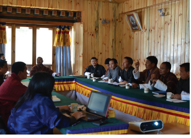
RSPN Officials and the group members