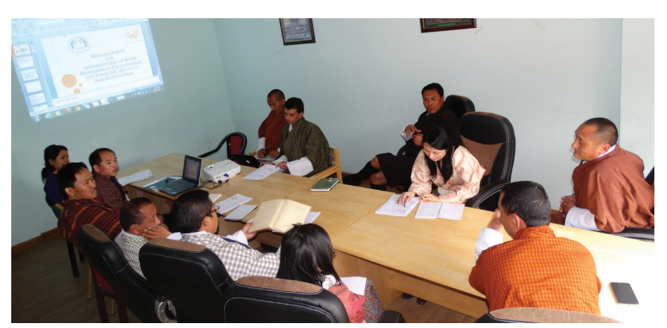
Discussion during the presentation among stakeholders

half-day presentation of Baseline Survey Report on "Strengthening Water, Sanitation and Hygiene (WASH) components of two Gewogs of Phuntshopelri and Yoeseltse in Samtse District was organized by RSPN on 13th April, 2015 in RSPN's Board Room, Thim-