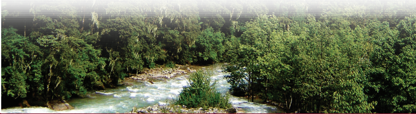
Vol.: 7, Issue: 2

Phuntsho Choden Tenzing Class VIII C Phuentsholing Lower Secondary School