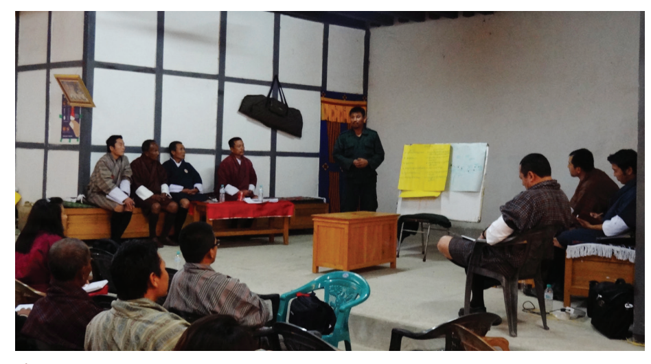
The meeting in session

White-bellied Heron is critically endangered in IUCN category and Bhutan has 22 individuals as per 2014 population census