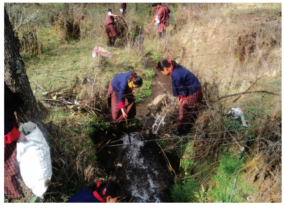
Students cleaning the stream

Phobjikha valley is known for having one of the largest high altitude natural wetland in the country. The wetland is fed by numerous seasonal and perennial streams flowing from the surrounding mountains. Besides number of important functions in an ecosystem, the wetland in Phobjikha is a winter home for more than 350 Blacknecked Cranes.