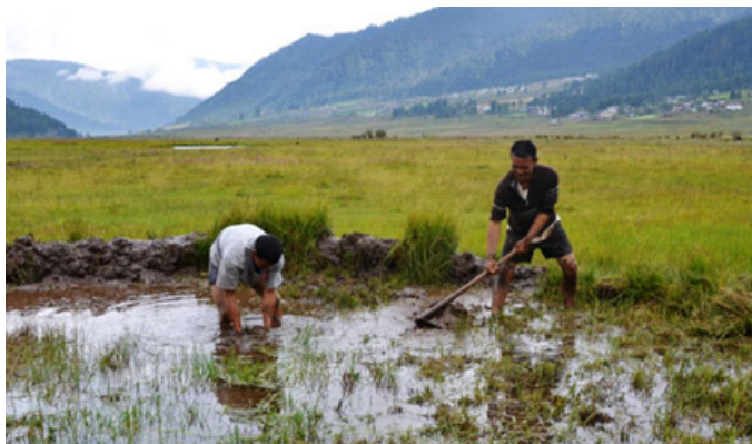
Maintenance of Crane roost in Phobjikha