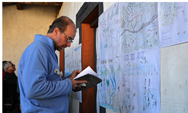
BNC enthusiast tourist - judging the art competition