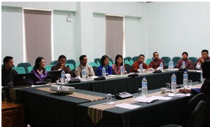
Participants - Knowledge sharing workshop on Gender and Energy

The project on “Improving Gender-Inclusive Access to clean and Renewable Energy in Bhutan, Nepal and Sri Lanka” aims to increase rural women’s access to affordable and reliable clean energy sources and technologies in selected project sites.