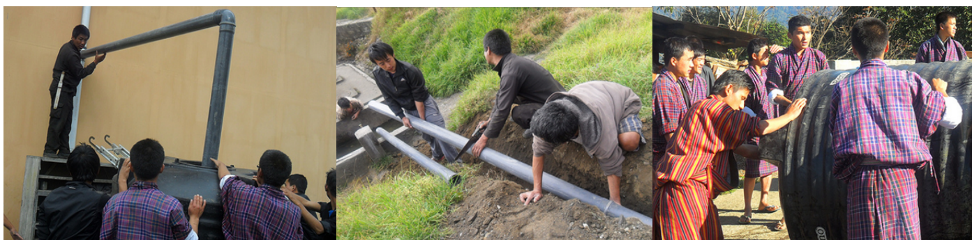
Students working for rain water harvesting

Problems of inadequate water supply for drinking and other purposes, particularly in schools and institutions are a major problem and Tashitse Higher Secondary School in Wamrong is one such example. To address the issue, RSPN field office in Wamrong initiated and installed a low cost and high efficiency