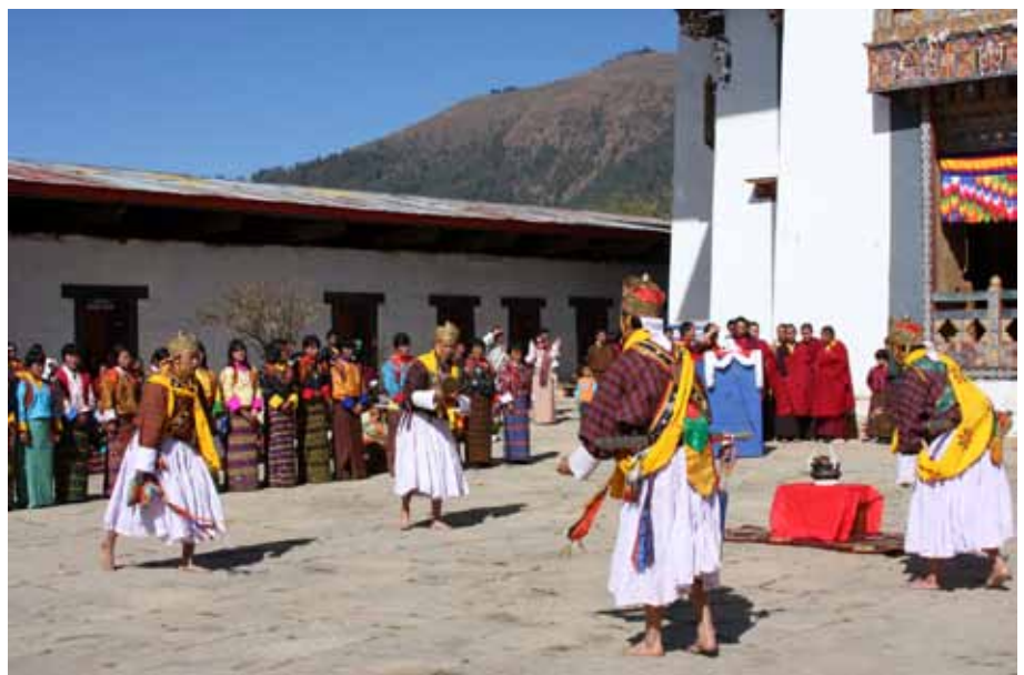
>> Festival started with marchang ceremony