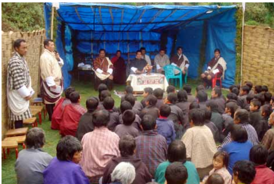
>> Certificate award event being graced by Drangpon of Thrimshing Dungkhag

The Certificate Award Day in Passangphu was jointly organized by the Trashigang Dzongkhag Forestry Sector, Kangpara Geog and Wamrong RSPN Field Office. The Dasho Drangpon of Thrimshing Dungkhag was invited as the chief guest to honor the certificate to the members of the Passa Norbulung Community Forest. The other guests present during the occasion were the Dzongkhag Forest Officers, teachers of Passangphu Primary School, Kangpara Gup, Kangpara Territorial Forest officer, Kangpara RNR Extension officers, the Geog Administration officer, and about 120 people from the villages of Passangphu, Maduwa and Padung.