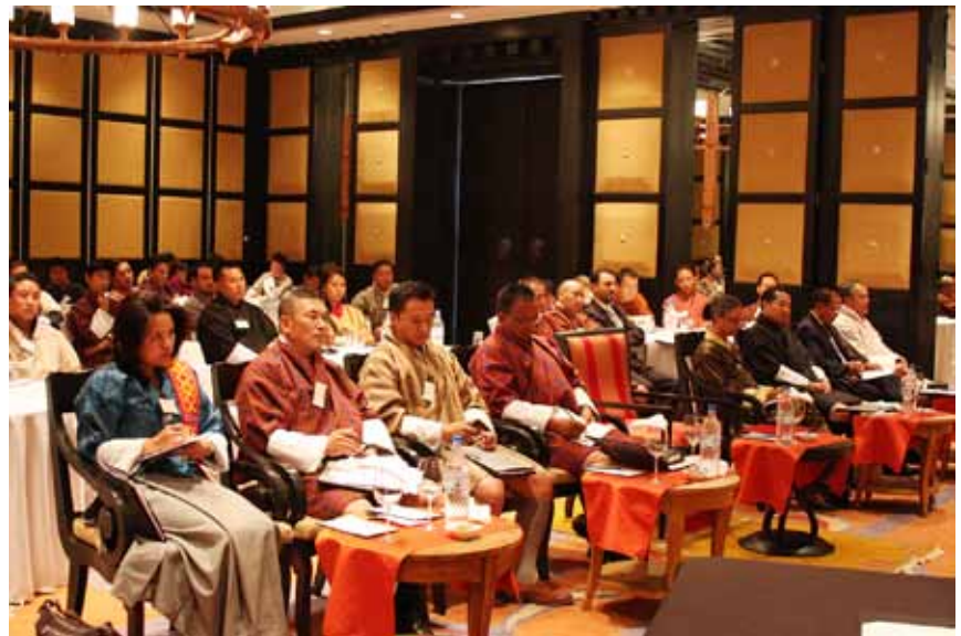
>> Participants of the workshop

The Royal Society for Protection of Nature, in collaboration with Climate Action Network South Asia (CANSA) and National Environment Commission organized one day sensitization workshop on Climate Change on 26 October 2009. The event, held at Taj Tashi in Thimphu, saw an overwhelming response from the parliamentarians and the government officials.