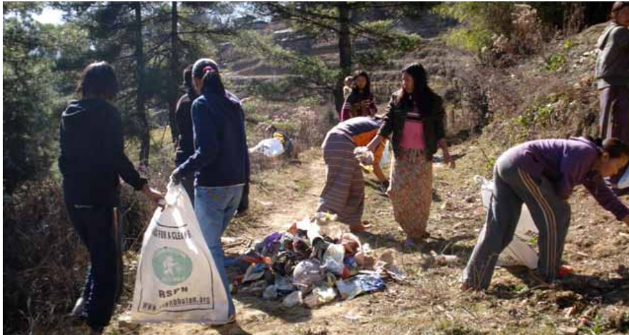
>> Local community and students actively participated in the activity

To commemorate the National Day of Bhutan, the Wangduephodrang Dzongkhag and the RSPN, through the Clean Bhutan Project organized a cleaning