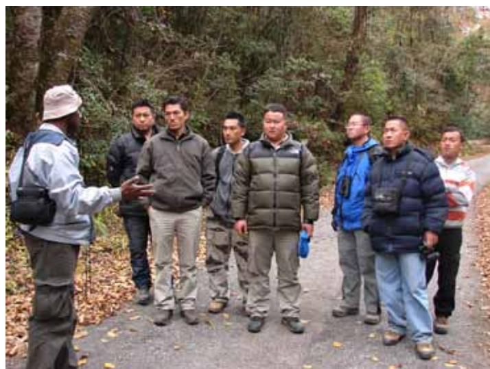
>> Trainees on their field trip with their instructor

A week long training course on wildlife survey and monitoring techniques for group of foresters was conducted at the Wildlife Institute of India, Dehradun. The trainees included four forest guards from