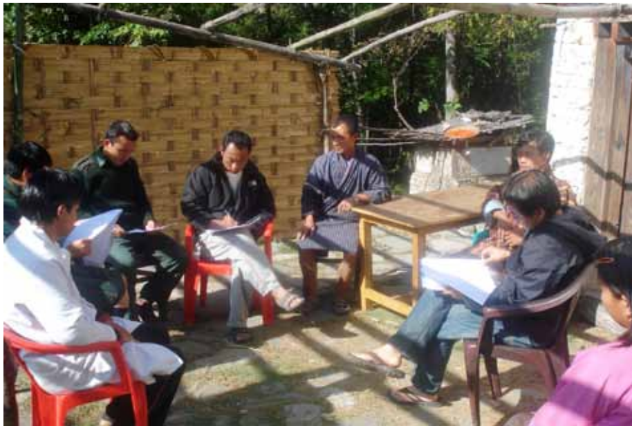
>> Consultation meeting in session

Kangpara Geog under Thrimshing Dungkhag, Trashingang, consists of 17 villages and home for more than 3000 inhabitants who sustain their livelihoods on subsistence farming. They significantly rely on forest resources such as cane and bamboo. However, over the last few years, heavy harvesting and unsustainable practices has caused degradation of the forest resources especially a bamboo species Nemicrocalamus andropogonifolius locally known as Ringshu. This resulted in declining the crafts business.