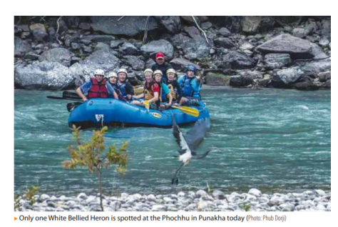
Number of White Bellied Herons decline Increasing disturbances are cited for the decline in the number of this critically

Conservationists and bird watchers are worried by the increasing disturbance of prime White-bellied Heron's (WBH) habitat and feeding site at Phochhu in Punakha.