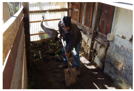
Karma is perhaps the first Black-necked Crane that has spent two full summers in Bhutan, all alone.