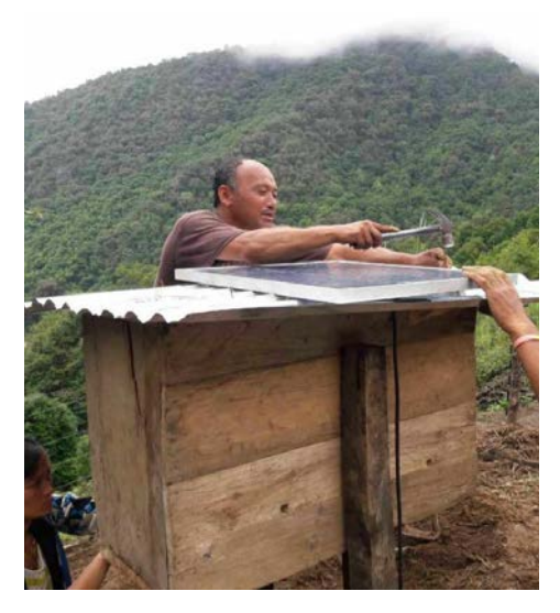
who no longer need to spend sleepless night guarding their crops and reap the benefits from increased yields.

In an effort to address this issue, RSPN supported the installation of electric fencing in Passaphu and Tshogoenpa through its Sustainable Agriculture Program (SAP) under Conservation and sustainable livelihoods Program (CSLP). The electric fencing work was implemented successfully in collaboration with the Local Government authority on a cost sharing modality with RSPN providing financial support to procure materials and other necessary equipment while villagers contributed the labor force. Through this initiative, the farmers were also trained on operation and maintenance of the fence. The electric fencing covers 2.35 kilometers of farm land in Passaphu and 3.5 kilometers of farm land in Tshogoenpa benefiting 25 households. The Tshogpas of both the villages shared that the electric fencing is a boon to the villagers