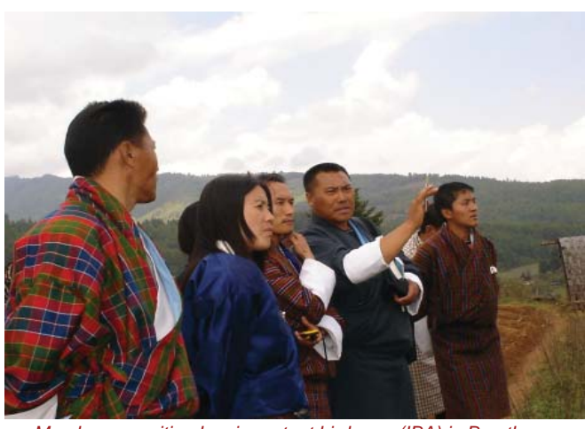
> Members sensitized on important bird area (IBA) in Bumthang

In an effort to mainstream conservation activities in the country, RSPN has initiated the establishment of Local Conservation Support Groups (LCSG) in Bumthang, Trashignag and Wangdue Dzongkhags. LCSG members comprise of government officials, local leaders, educationists and businessmen who will propagate environment conservation messages to the grassroots. The main objective