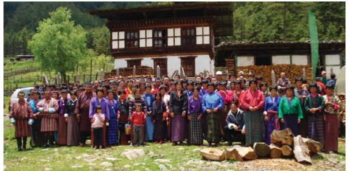
> Participants of awareness program

RSPN, in collaboration with the Renewal Natural Resource Centre (RNRC) in Phobjikha conducted an awareness program on the impacts of agrochemical fertilizers for the local community of Phobji and Gangtey Gewogs. The awareness workshop was conducted