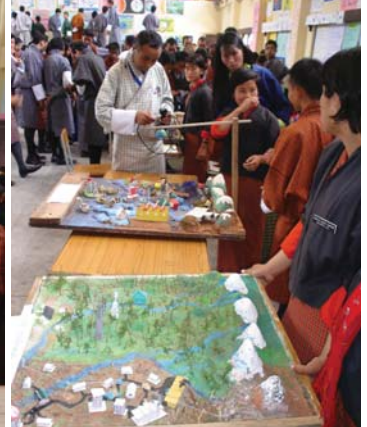
> Various schools exhibited on environment related issues as a part of day's event

World Environment Day is a global event celebrated all over the world to focus global attention on the importance of the environment and to enhance political attention and action. The event is also intended to sensitize people on emerging environmental issues that could threaten humanity and the earth's biodiversity. Mostly, World Environment Day aims to bring about positive changes in people's attitude towards the environment.